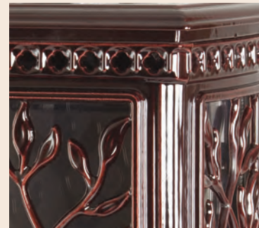
Majolica Brown Enamel

Soft black paint tones echoes and highlight the richness of cast iron finish.