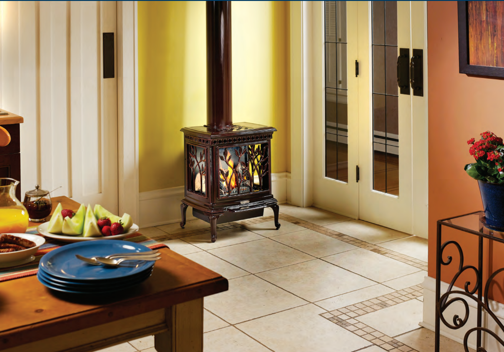
The Eden is shown in the brown enamel finish.

With its organic styling characteristic of the larger Tree of Life gas stove and featuring the revolutionary GreenSmart system – the Eden cast iron gas stove by Avalon is an excellent choice when looking for an elegant, smaller-sized freestanding stove with the latest in energy-efficient gas technology.