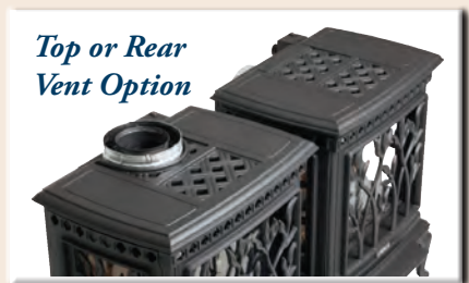
Top or Rear Vent Option

With its smaller size at 21-inches wide by 26-inches tall, the Eden complements intimate spaces and cozy nooks where a larger stove can overpower the area with both its size and heat output. The Eden produces up to 22,000 BTUs, along with an exceptional turn-down ratio of 70-percent – for fantastic control over the amount of heat produced. Additionally, the Eden boasts smaller clearances to adjoining walls (5” in the back and 3-1/2” on the sides) – so you can literally tuck it into small alcoves and niches. And despite its size, the Eden boasts an incredibly large 416 square inches of fire-viewing area with three sides of glass openings – to highlight the realistic dancing-flame fire.