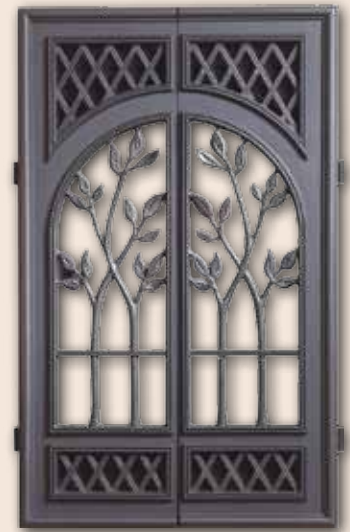
Tree of Life TM Face

The organic Tree of Life double door face design features cast iron charcoal paint finish