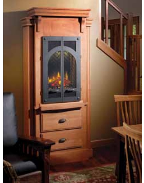
Shown above with the Bungalow face and J. C. Huffman Mission cabinet.