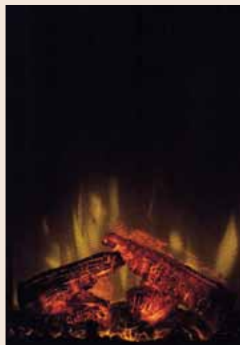
Standard Black Interior

The interior of the Hideaway E comes in standard black. You have the option of upgrading the interior with the Herringbone Brick liner. The interior liner comes with two side pieces and one-way glass to add a great amount of character and depth to the fireplace! Use the remote control to adjust the intensity of the downward shining LED accent lights to control the amount of interior lighting that you desire for your fireplace!