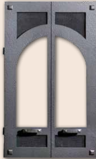
Bungalow TM Face

The Bungalow TM double door face design features a charcoal powder coated textured surface.