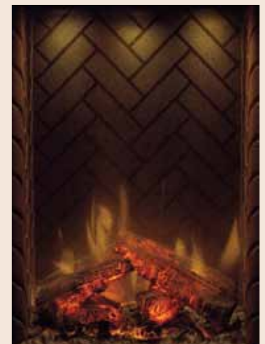
Herringbone Brick Interior