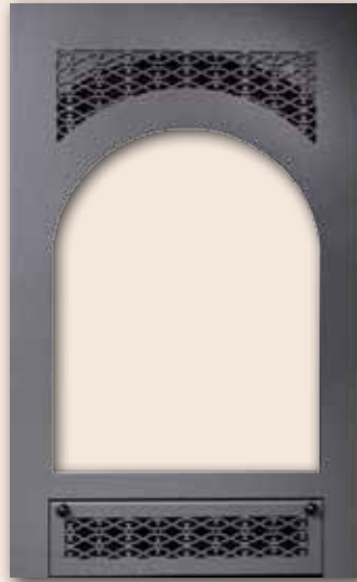
Victorian Lace TM Face

The delicate Victorian Lace face design features woven grill work in a charcoal paint finish.