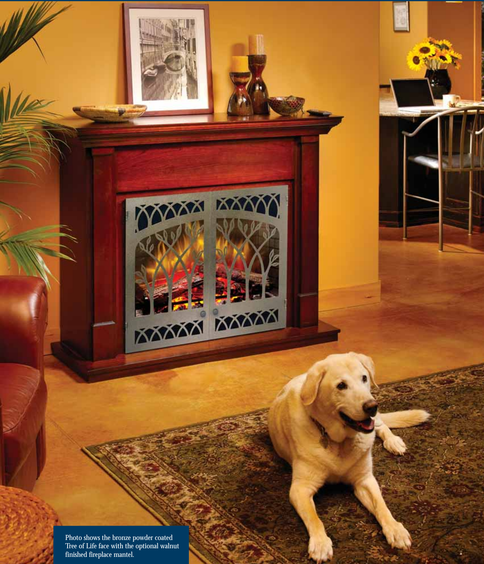
Photo shows the bronze powder coated Tree of Life face with the optional walnut finished fireplace mantel.